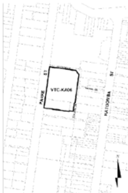
Katoomba Precinct VTC-KA06—Cultural Precinct