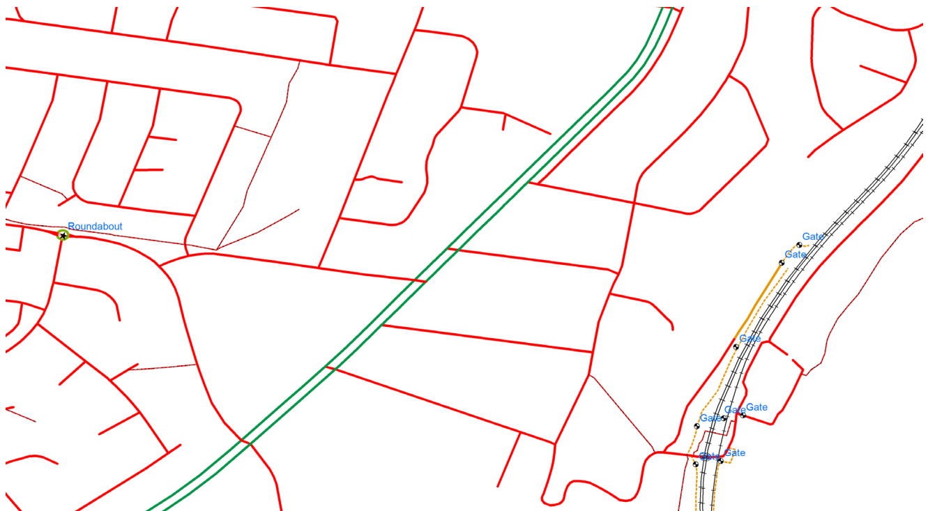
Image depicts sample of the Road Associated Facilities dataset